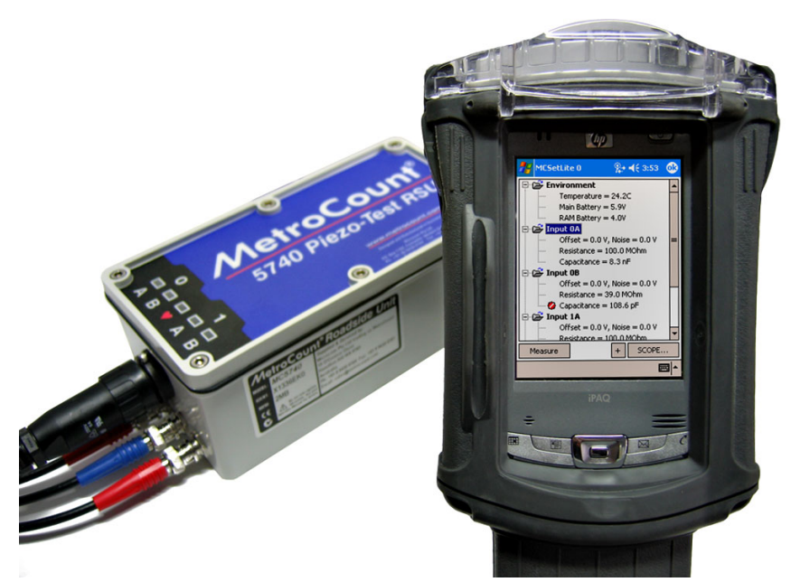
Checking piezo sensors with an MC5740 and Pocket PC

Instantaneous measurements are performed using the MC5740's View mode. Measurements that are not within a reasonable range of values will be highlighted with a red circle. The MC5740's Scope mode displays piezo sensor output voltage versus time, for a pair of inputs.