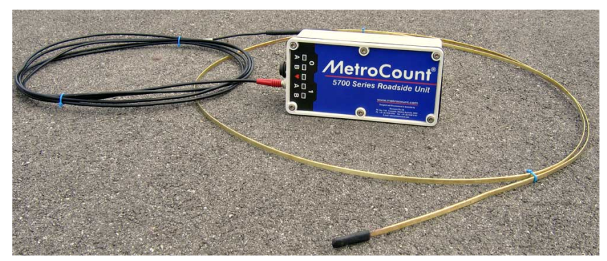
MC5710 with Measurement Specialties BL Piezo Sensor

The MetroCount 5710 is a two-channel vehicle classifier, designed for use with piezo-electric axle sensors. The MC5710 uses the same time-stamped raw data format used by MetroCount's other vehicle classifiers, providing a high degree of accuracy, and the array of analysis tools provided by MCReport.