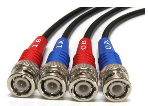
Terminate coaxial cable with BNCs

All sensor cables need to be terminated with BNC connectors. These are commonly available, with appropriate cable stripping and crimping tools. Each cable should be fitted with strain relief boots, clearly marked and colour-coded.