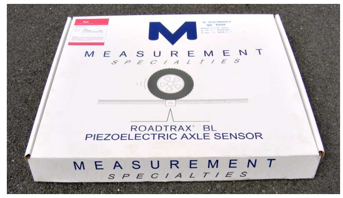
Measurement Specialties Roadtrax BL Sensor

The MC5710 is optimised for the Measurement Specialties RoadTrax BL Traffic Sensor , which give exceptional results when installed per the manufacturer's recommendations. A Class II sensor should be used with the MC5710. These are more economical than the Class I BL sensor used for weigh-in-motion applications.