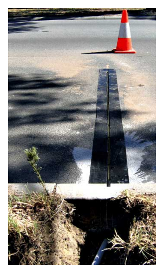
BL Sensor installed, ready to be encapsulated